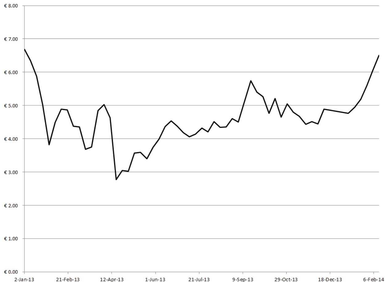
Figure 2: EU ETS Phase 3 Allowance Market Prices (January 2, 2013 to February 12, 2014)