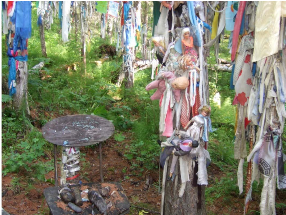
Figure 6. Arzhaan , a mineral stream at Ush-Beldyr place in southern Tyva. Barren women tie dolls asking the owners of the stream and Ush-Beldyr place to assist to give a child to them.