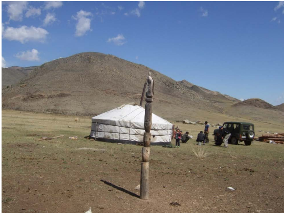
Figure 4. A tethering post in the arat's camp in Bai-Taiga