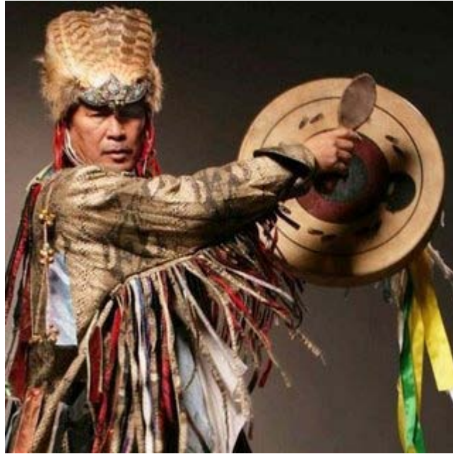
Figure 3. Tyvan shaman.