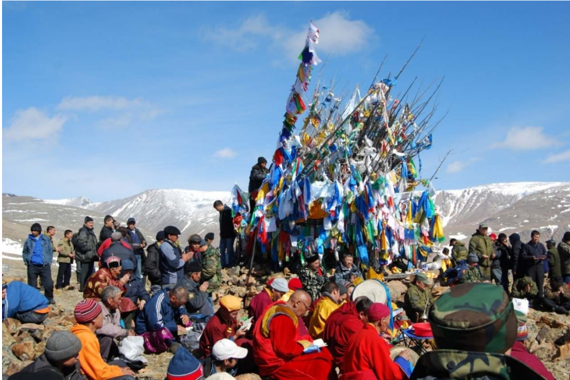
Figure 5. Sanctification ceremony in Bai-Taiga