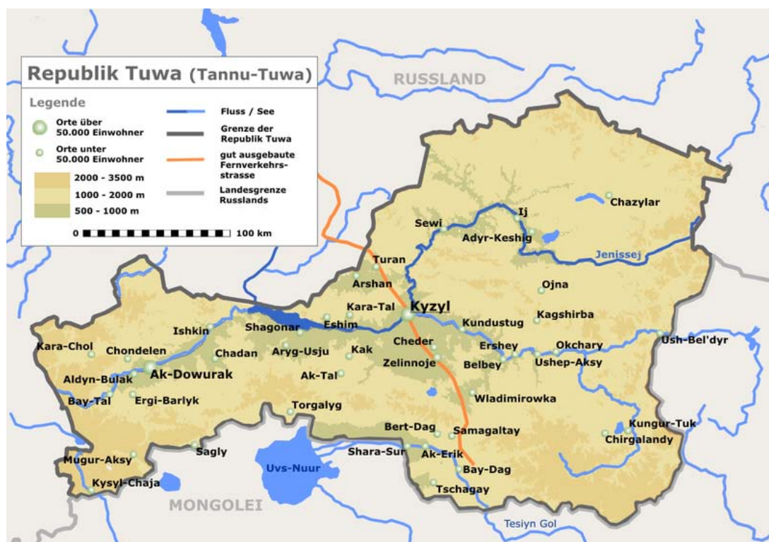
Map 2. Tyva Republic.

The interview process was opportunistic. I interviewed people who were available. The interviewees included four women and five men. Seven interviewees were more than 50 years old; two interviewees were in their middle 30s.