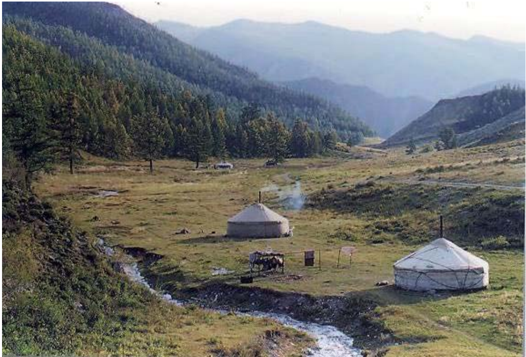
Figure 1. Summer aal .