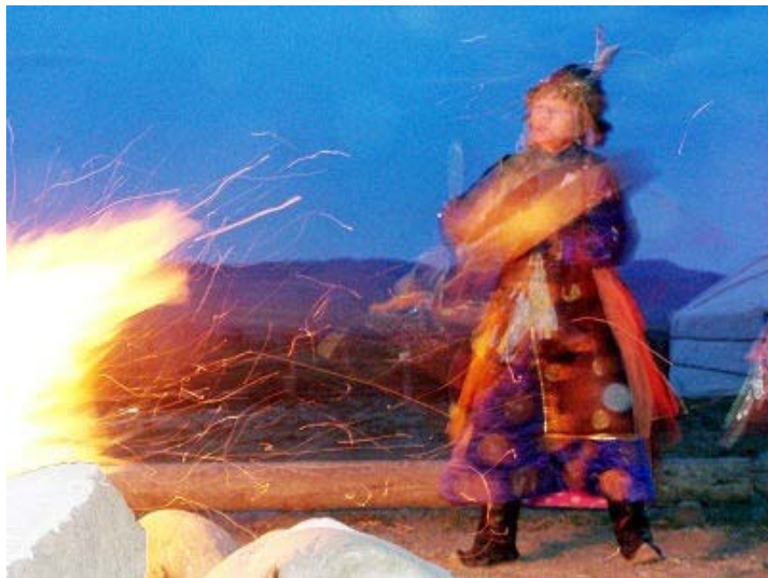
Figure 2. Tyvan boots.