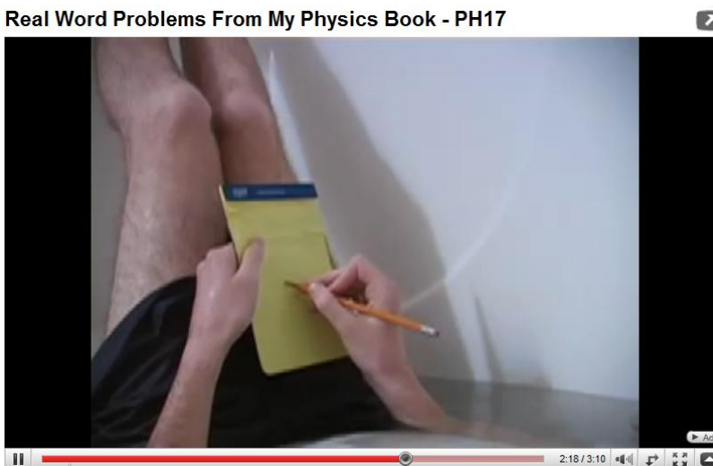
Figure 2. Sketch what your view of the cup and soap dish is...