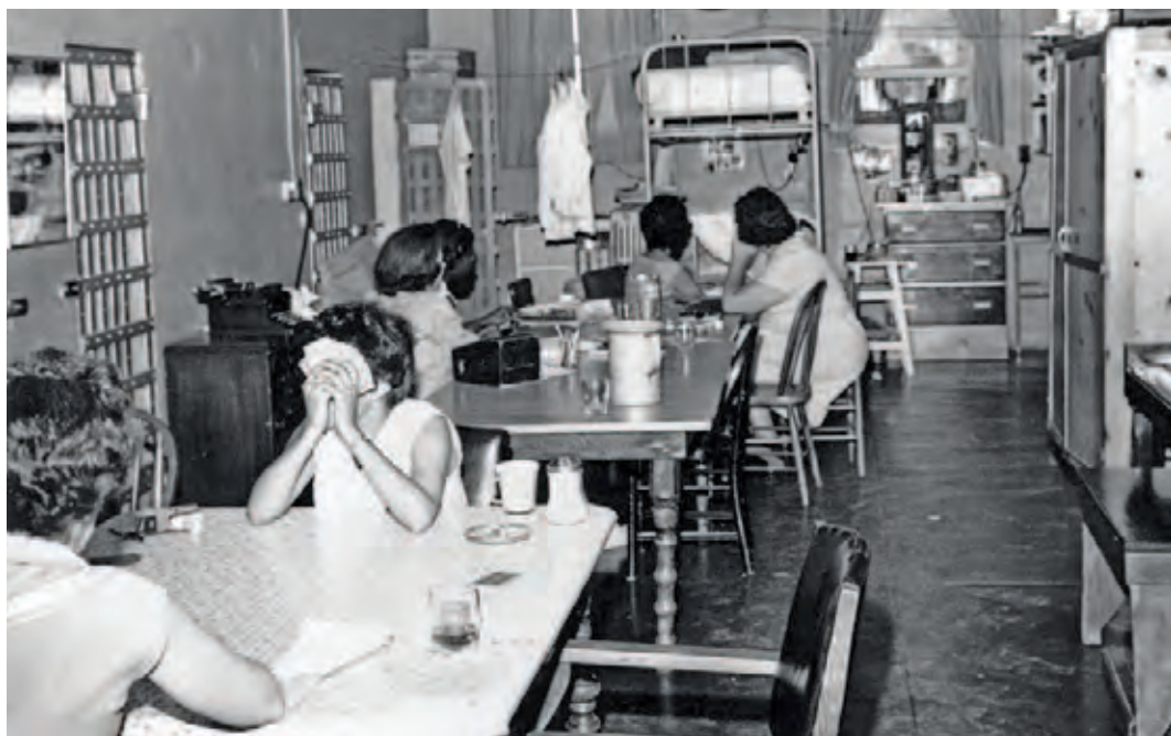
The women's ward in the Singleton era, about 1960