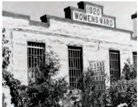
IDAHO STATE HISTORICAL SOCIETY