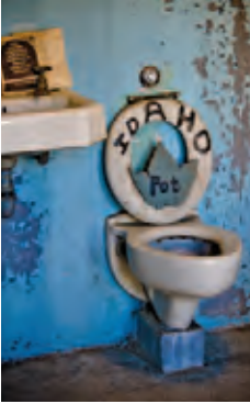
Idaho toilet, Old Penitentiary Museum