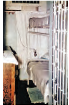
IDAHO STATE HISTORICAL SOCIETY