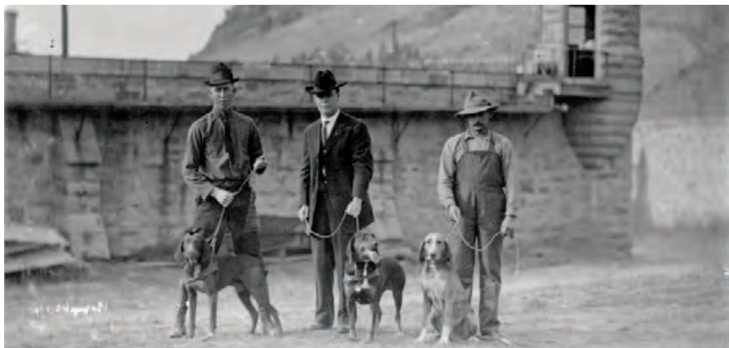
Guarding the Idaho penitentiary