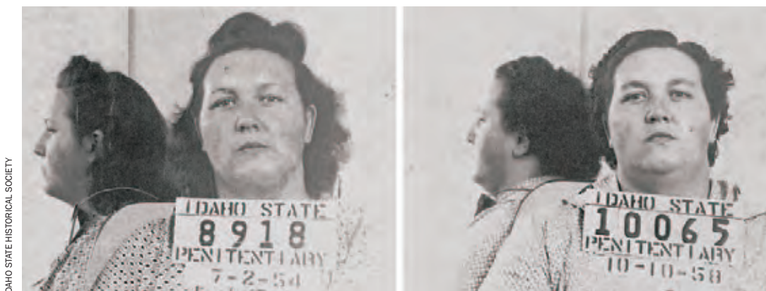
IDAHO STATE HISTORICAL SOCIETY