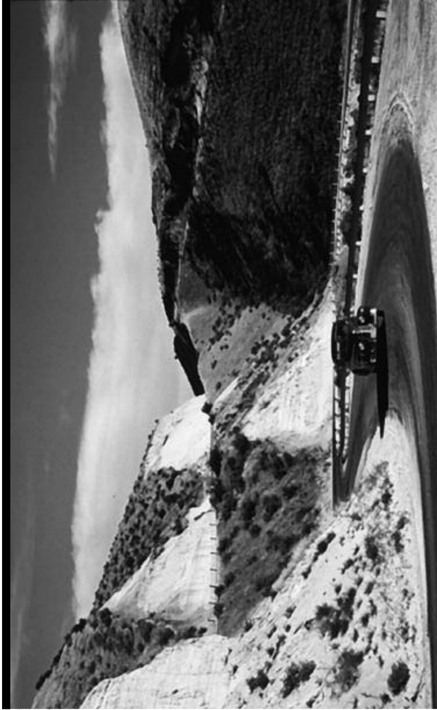
Works Progress Administration photographer Russell Lee contrasted the lushness of orchards in Emmett with the barren cut through Freezeout Hill, 1941