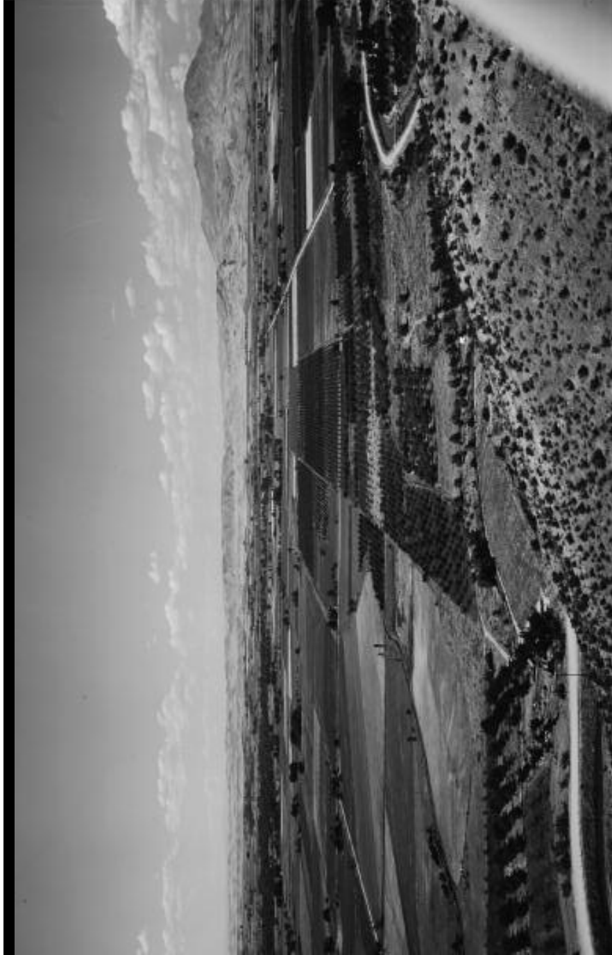
Cherry orchards beneath Emmett's Valley of Plenty