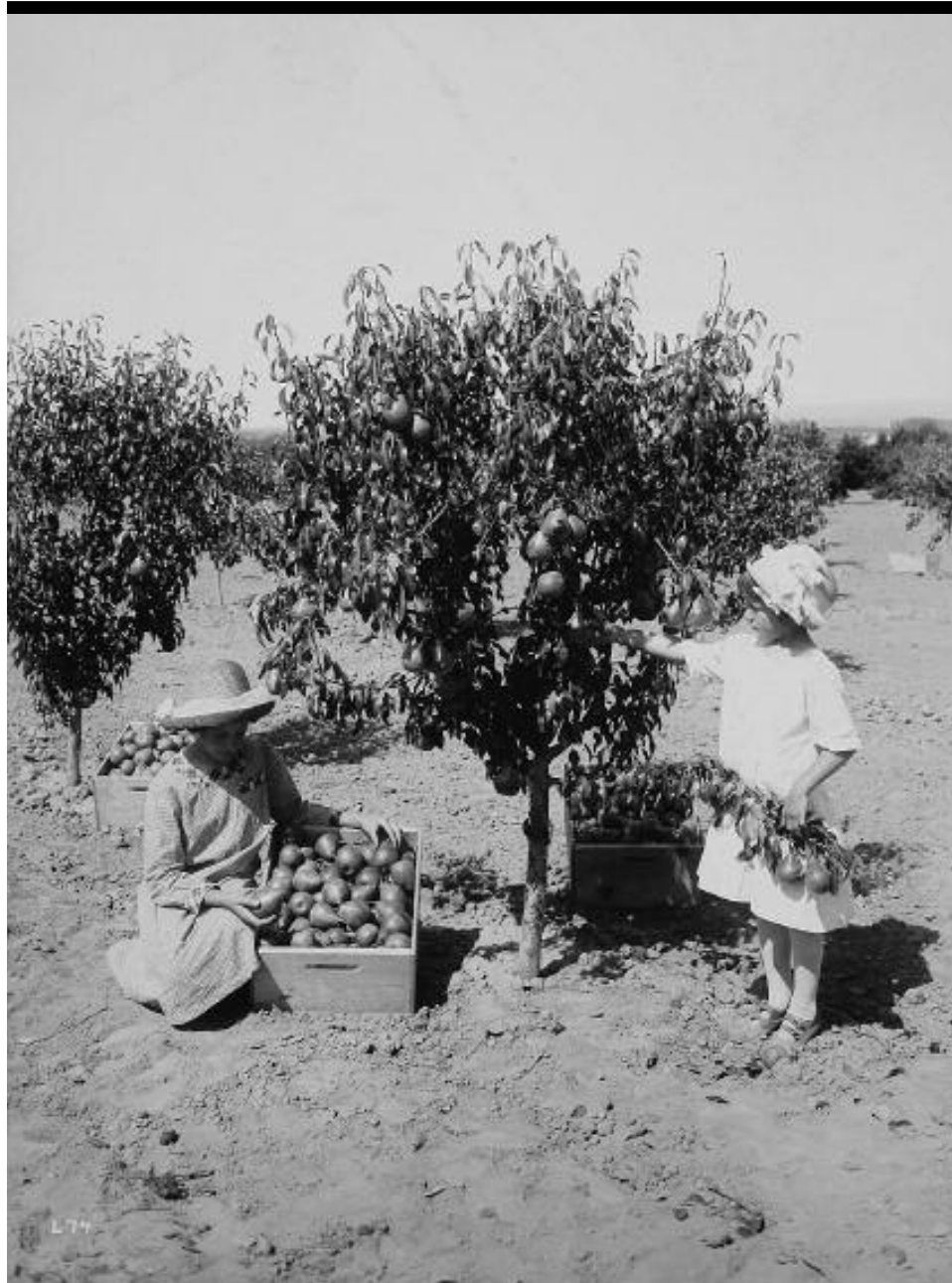
Idaho State Historical Society