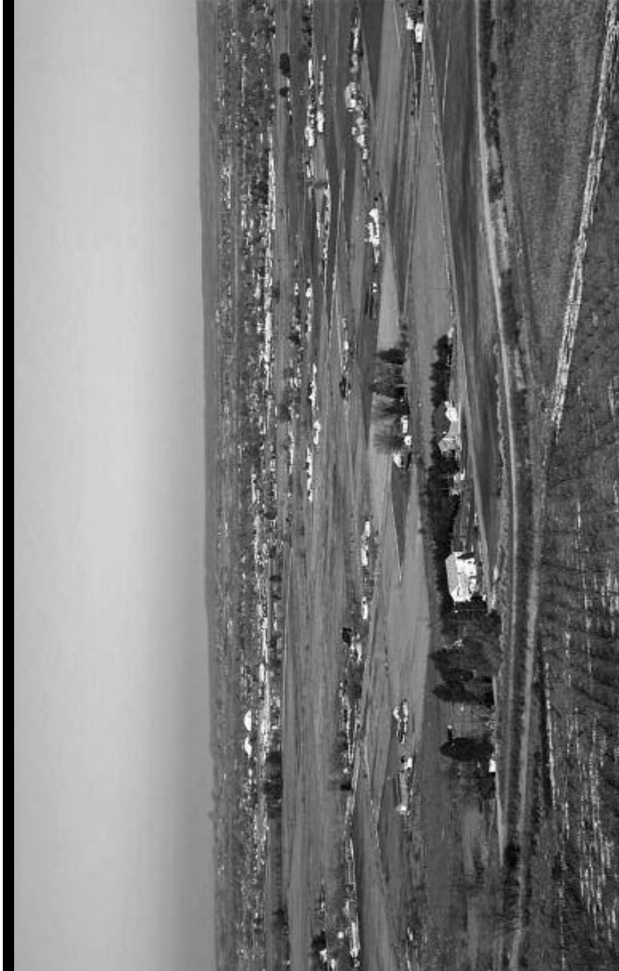
Subdivisions pave over farmland in the Valley of Plenty between Squaw Butte and Freezeout Hill, 2008.