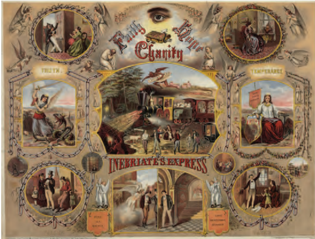
Temperance crusader poster circa 1870

Boise officials mostly tolerated the bawdy houses so long as the vice could be confined. But pastors, boosters, and reformers pushed hard in the other direction. The Woman's Christian Temperance Union, the Columbian Club, the Ladies Auxiliary of the Florence Crittenton Home, and many other civic organizations backed mayors who denounced prostitution, demanding reform.