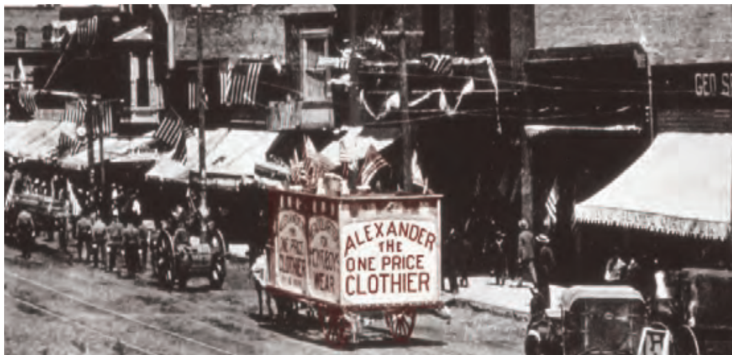
A wagon advertises Moses Alexander's Men's Store on the 700 block of Main Street, about 1896. Alexander spearheaded the anti-prostitution crusade.