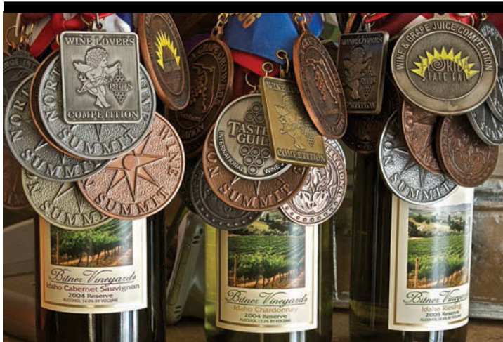
Bitner's award-winning wines.