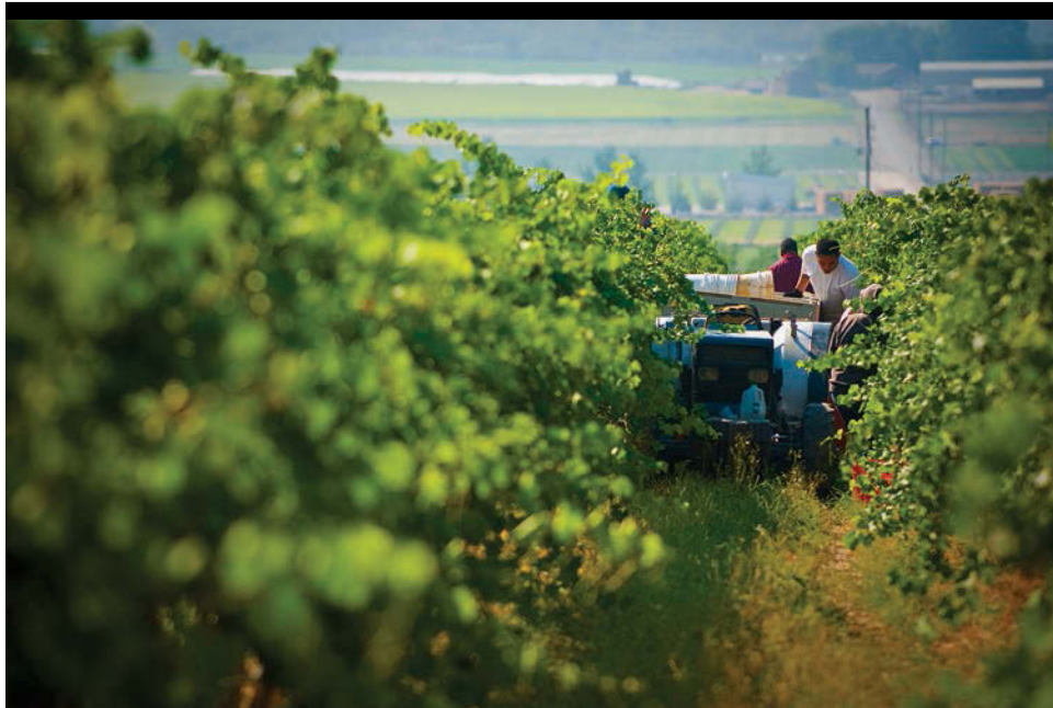
Idaho Wine Commission