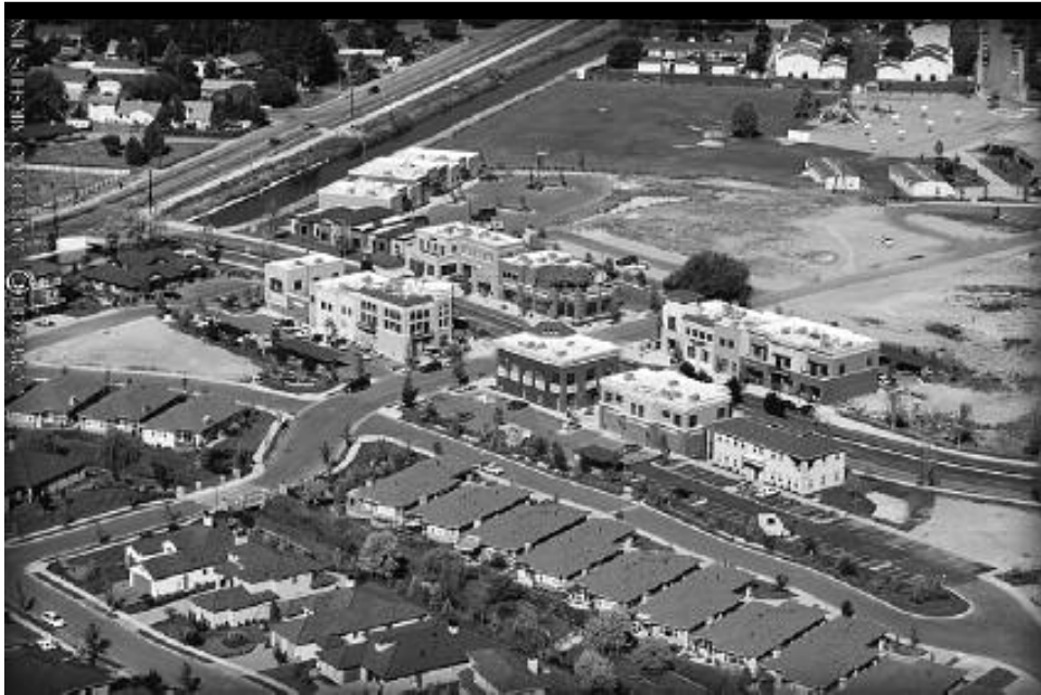
Idaho Airships, Inc.

Bown Way connects Parkcenter Boulevard to Boise Avenue. Bown Crossing, opened in 2006, is a 36-acre tribute to New Urbanism with its compact mix of restaurants, shops, offices, townhouses and patio homes.