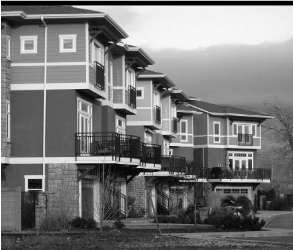
Condominiums are among the mix of residential choices for residents in Bown Crossing.

According to Derek O’Neill, they conducted a combination of 72 public and neighborhood meetings during the planning and development process of Bown Crossing. During these meetings, neighbors and the city discussed concerns about connecting walking paths between Bown and existing neighborhoods to the east and north. The Ada County Highway District wanted a major connector between Parkcenter Boulevard and Boise Avenue to cross at Holcomb Road. O’Neill applied the outcomes of these discussions to the final version of the development. The highway district eventually discovered that a connector road twice as long as the one there now was not only cost-prohibitive, but it also would certainly disrupt the quaint nature of the current