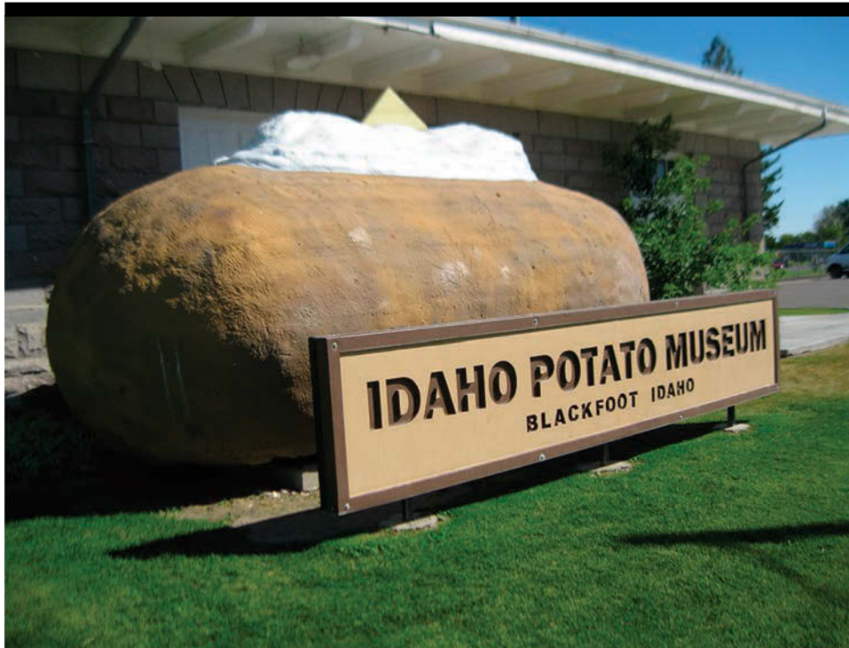
Aggressive marketing lures busloads of tourists to the stone depot in Blackfoot that houses the Idaho Potato Museum.