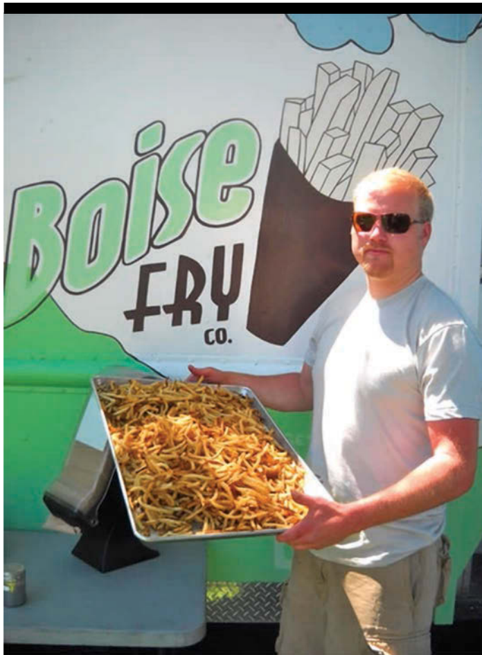
Boise Fry Company

Idaho Fry Company became Boise Fry Company after a trademark challenge from the Gem State's potato commission. BFC perseveres despite a disputed trademark claim to the name of the city as well.