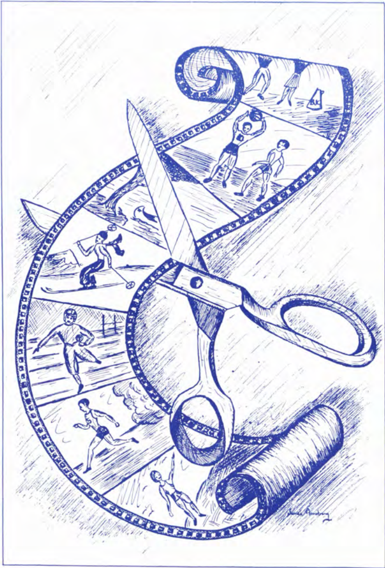
Scene VII CAMPUS LIFE