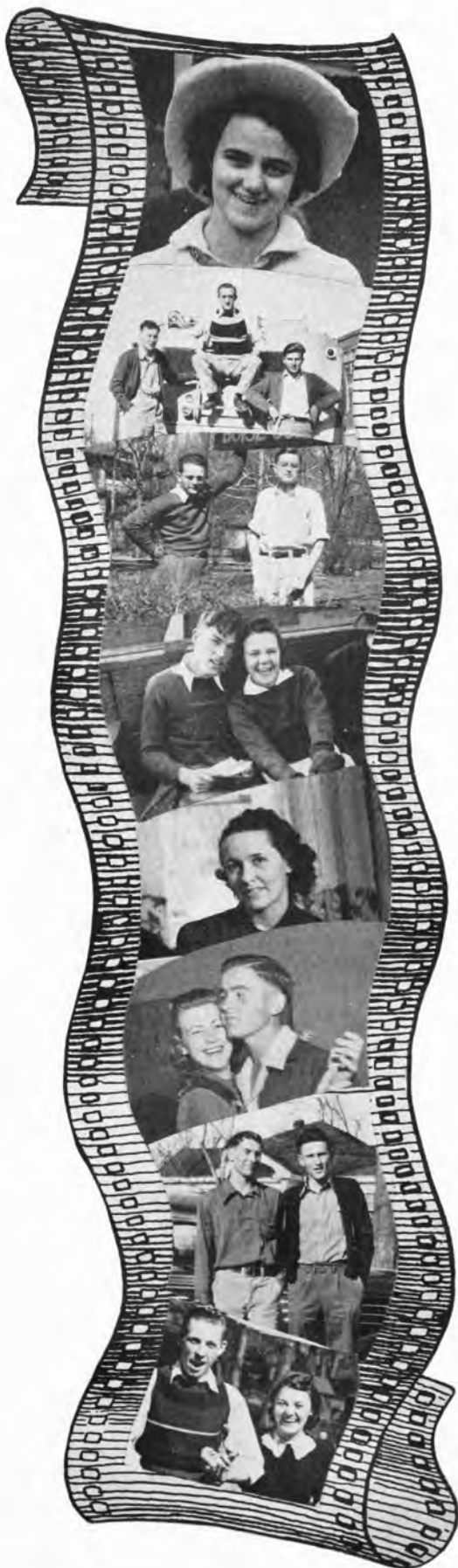
A big smile and a big hat