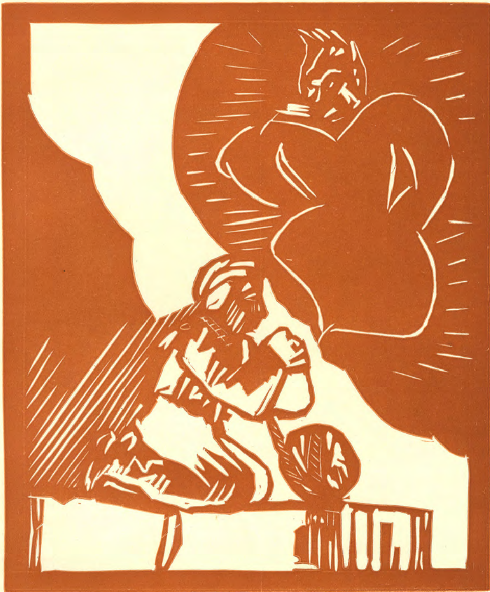
ALADDIN RUBS THE RING