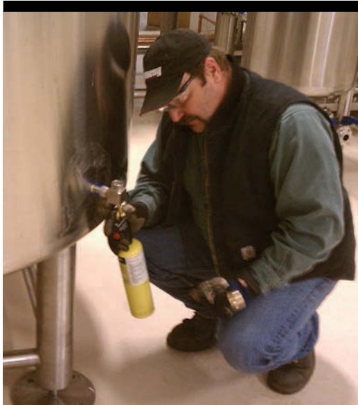
Payette Brewing Company

Boise's Payette Brewing Company, founded in 2010, runs a 15-tank brewing system. The Garden City brewery is the first in Idaho to can beer.