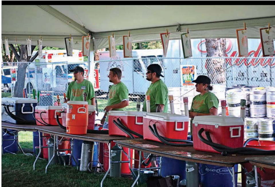
Treasure Valley Food and Wine Blog

Bracing for the thirsty mob at Boise's 2011 Beerfest. A dispute with park officials has since forced the festival to Meridian.