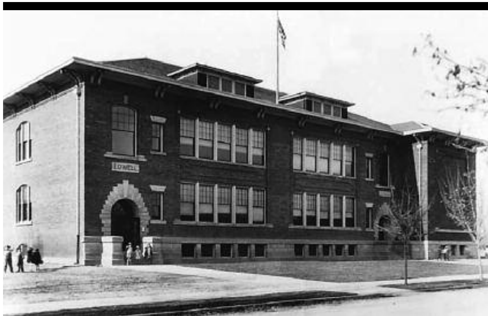
Idaho State Historical Society

city center still close enough to be convenient by means of the streetcar, the first developers of the West End could market their land as the perfect suburban combination of rural peace and urban access, available to all. Fairview Addition lots, platted at 50 x 122 feet, went for a standard price of $150