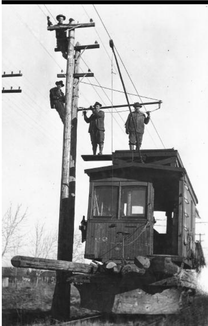
Idaho State Historical Society