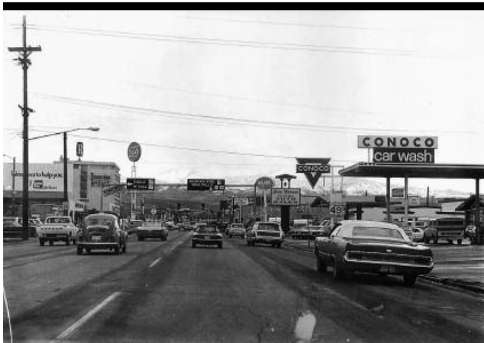
Capital City Development Corporation

“homes are scattered all over the city from Pleasanton addition on the west to Eden Home and the East Side additions to the east.” Many of these bungalows still stand today throughout the Pleasanton and Fairview Additions, contributing to a varied streetscape of intact homes representing some of