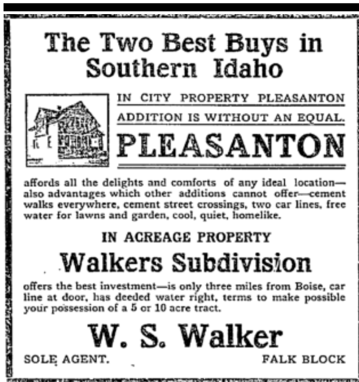
Advertisement for Pleasanton Addition, May 1910.