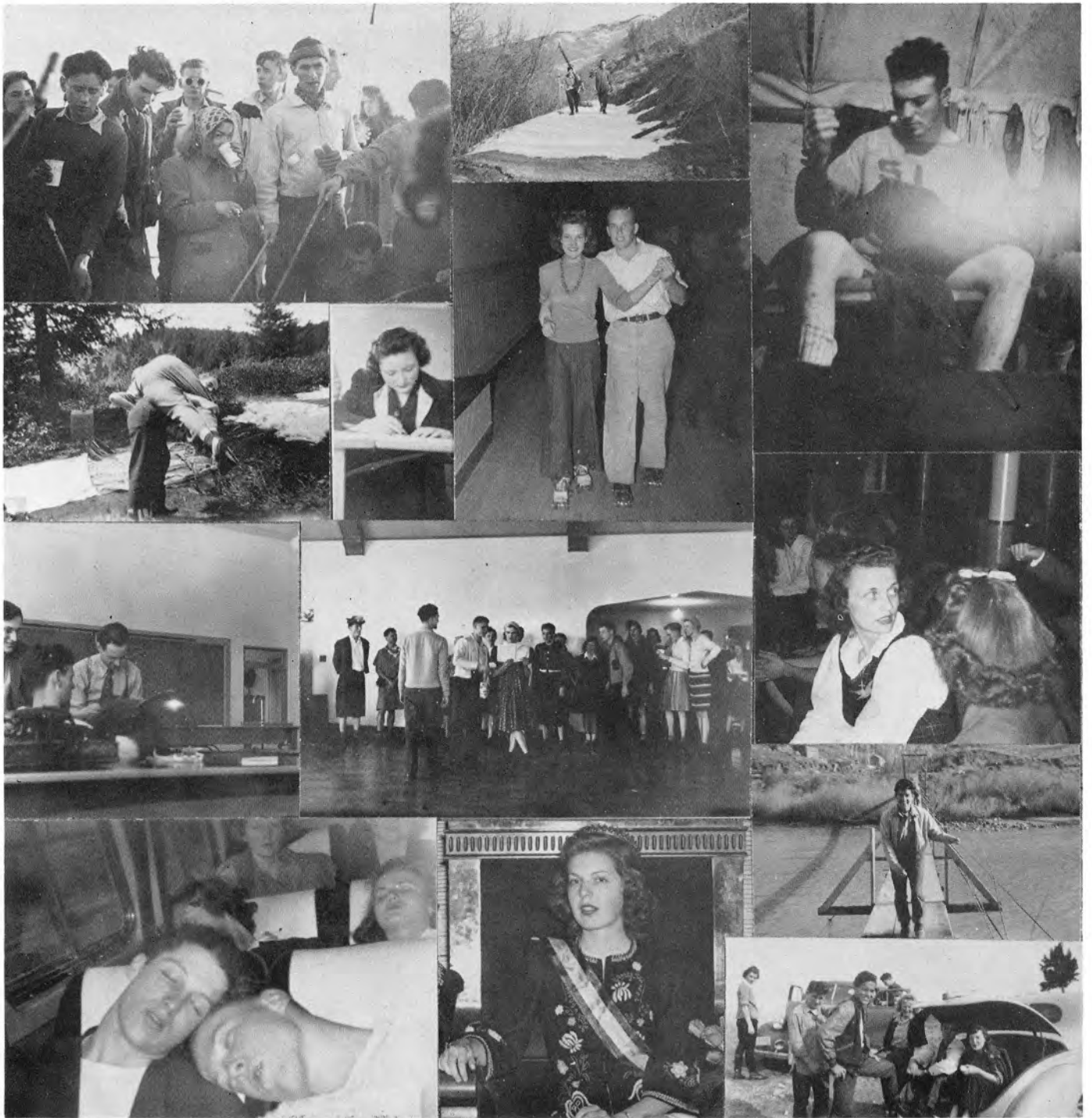
Vittles and vitamins . . . Traveling? . . . "A stitch in time" . . . Oopsie daisy . . . Studying? . . . Lovely pose . . . Class work? . . . Lovely ladies . . . Right face . . . Catching up . . . Duchess . . . London bridge . . . Where to?