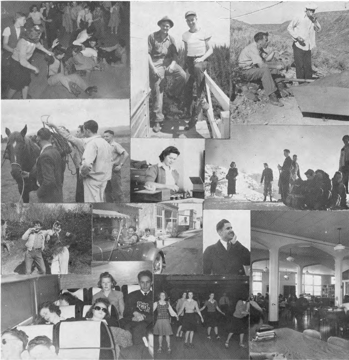
Oops! . . . Easy job . . . Chow . . . Who rides? . . . Industry . . . Snow party . . . Whoo-who . . . Time out . . . Haw-haw! . . . Why so tired? . . . Having fun? . . . Sh-h-h!