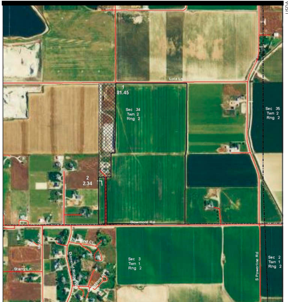
Canyon County's population grew by about 40 percent, 2000-2010. Pictured: farmland for sale near Nampa.

While the Sparks farm provides an encouraging example to those who lament the loss of local farmland, it is an exception to a pattern that has seen Ada County lose 14 percent of its farmland between 2002 and 2007 as rural housing developments popped up to accommodate anticipated population growth. Canyon County, with more acres in agriculture, lost 4 percent. Alarmed by the loss of cropland, a handful of organizations—the Coalition