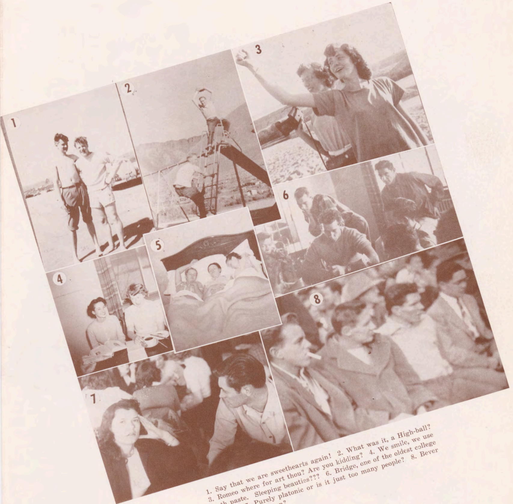
1. Say that we are sweethearts again! 2. What was it, a High-ball? 3. Romeo where for art thou? Are you kidding? 4. We smile, we use tooth paste. Sleeping beauties??? 6. Bridge, one of the oldest college courses. 7. Purely platonic or is it just too many people? 8. Bever where is your women?