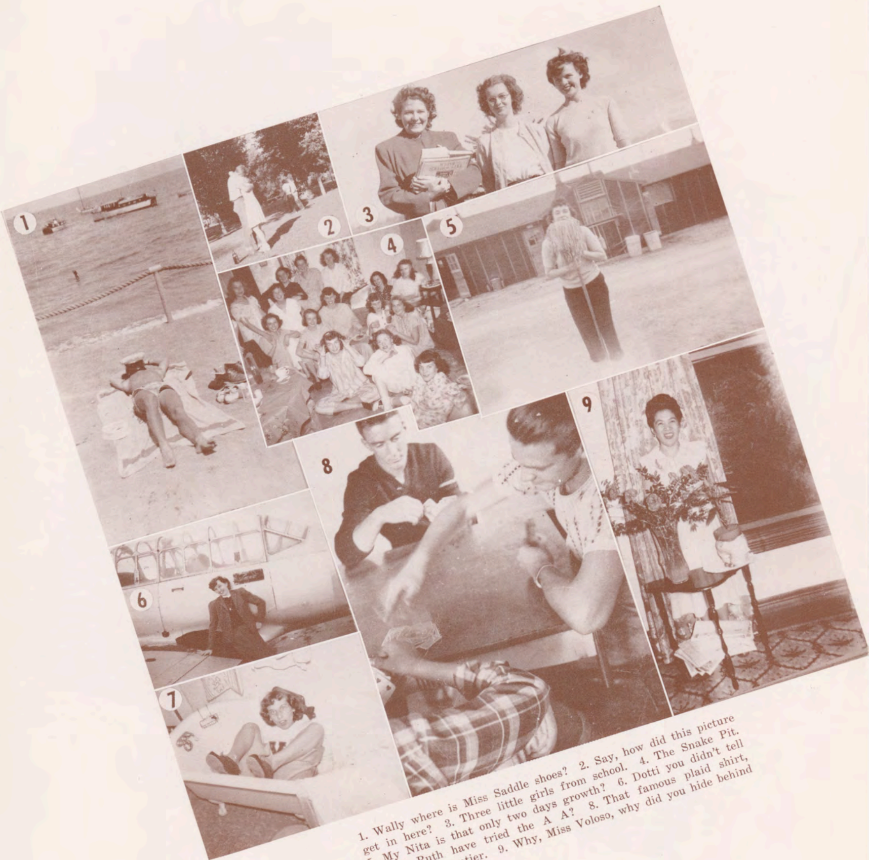
1. Wally where is Miss Saddle shoes? 2. Say, how did this picture get in here? 3. Three little girls from school. 4. The Snake Pit. 5. My Nita is that only two days growth? 6. Dotti you didn't tell us. 7. Ruth have tried the A A? 8. That famous plaid shirt, could be Carpentier. 9. Why, Miss Voloso, why did you hide behind the flowers?