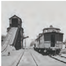
NAMPA COALING STATION