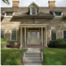
FORT BOISE OFFICER'S QUARTERS