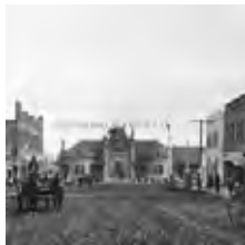
DOWNTOWN NAMPA, 1907