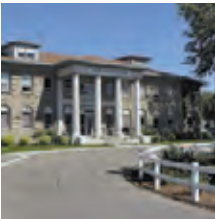
STATE SCHOOL AND HOSPITAL