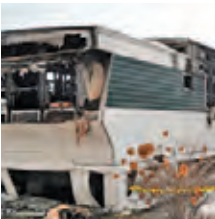
FIRE-RAVAGED MOBILE HOME