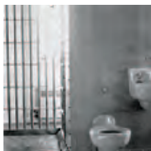
CELL AT THE COURTHOUSE JAIL