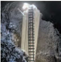
ENTRANCE TO KUNA CAVES