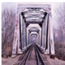
RAILROAD BRIDGE, 1985