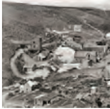
PEARL, IDAHO, 1902