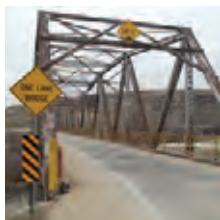
BRIDGE AT CANYON CROSSING