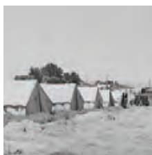
FSA RESETTLEMENT CAMP WILDER LABOR CAMP, 1941