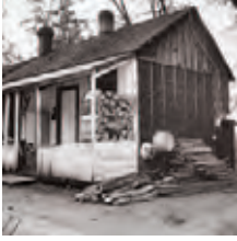
MULE PACKER'S CABIN