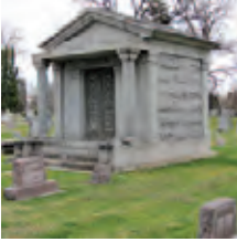
MORRIS HILL CEMETERY