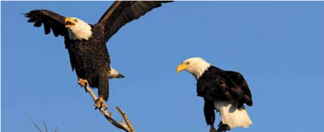
Bald eagles look for prey.