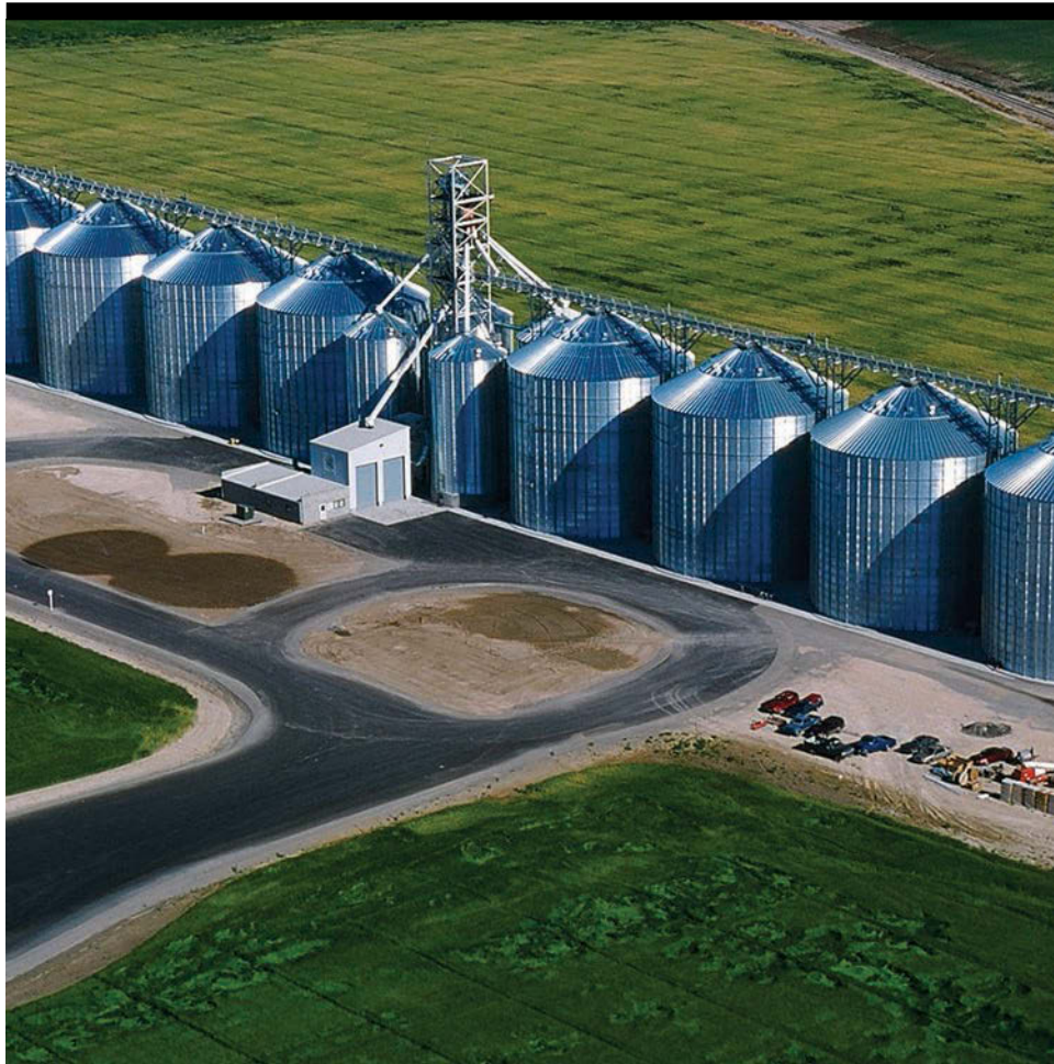
SCAFCO Grain Systems

Barley growers mostly favored the House version of 2012 farm bill with subsidies for crop insurance. Pictured: storing barley.