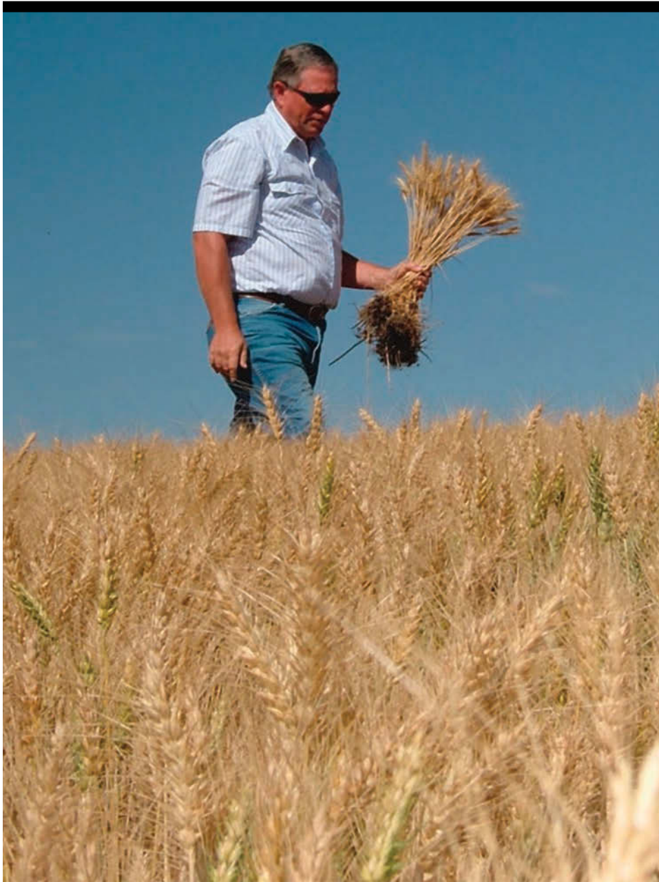
Idaho Wheat Commission

Idaho wheat farmers have received more than a billion dollars in federal farm subsidies since 1995. The state ranks fifth in wheat exports.