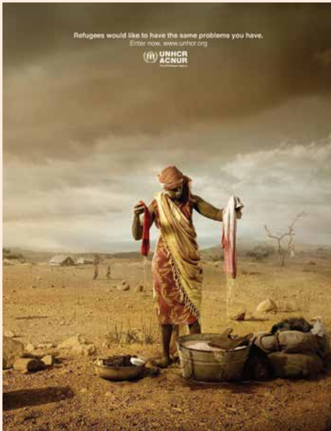
“Refugees would like to have the same problems you have.” World Refugee Day promotion, Buenos Aires, 2010.

World Refugee Day is now like a family reunion, tearful and joyous, an extravaganza of colors and sounds. On tap for 2017 are Burmese dancers, Burmese dumplings, Somali sambusas, jewelry, textiles, and hand-stitched Ethiopian dolls. New Americans will again crowd into City Hall Plaza for a collective oath of allegiance. Soccer teams will compete for the second annual Refugee Day tournament trophy, before Boiseans sitting under pastel umbrellas in Ann Morrison Park.