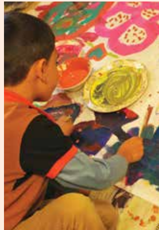
SYRIAN RELIEF & DEVELOPMENT