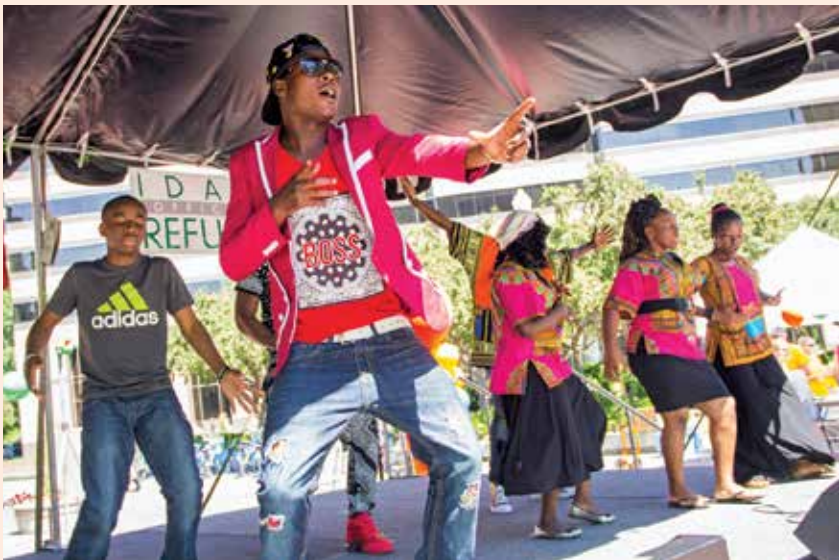
IDAHO OFFICE FOR REFUGEES