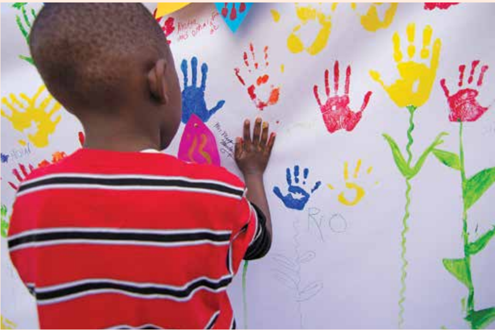
IDAHO OFFICE FOR REFUGEES