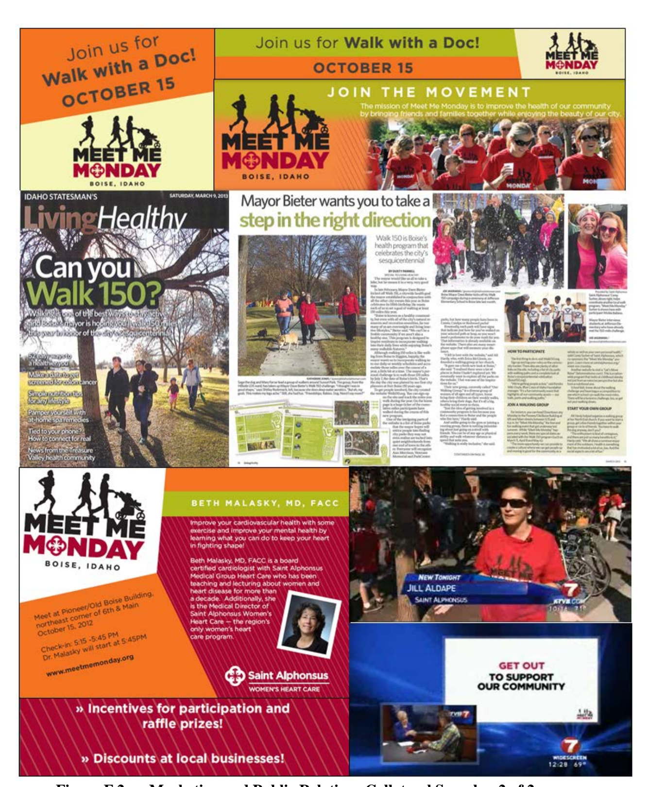
Figure F.2 Marketing and Public Relations Collateral Samples, 2 of 2