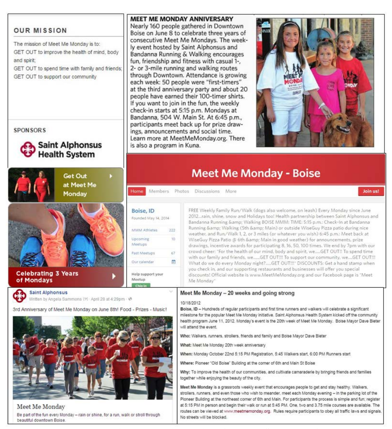
Figure F.1 Marketing and Public Relations Collateral Samples, 1 of 2