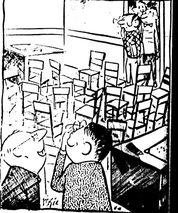
"I put a desk at both ends of the classroom — one for each one of those students who always sit in the back row."