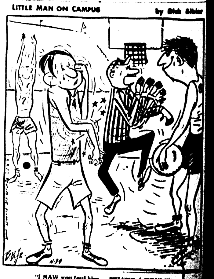
"I SAW you foul him - THAT'S A FOUL!"