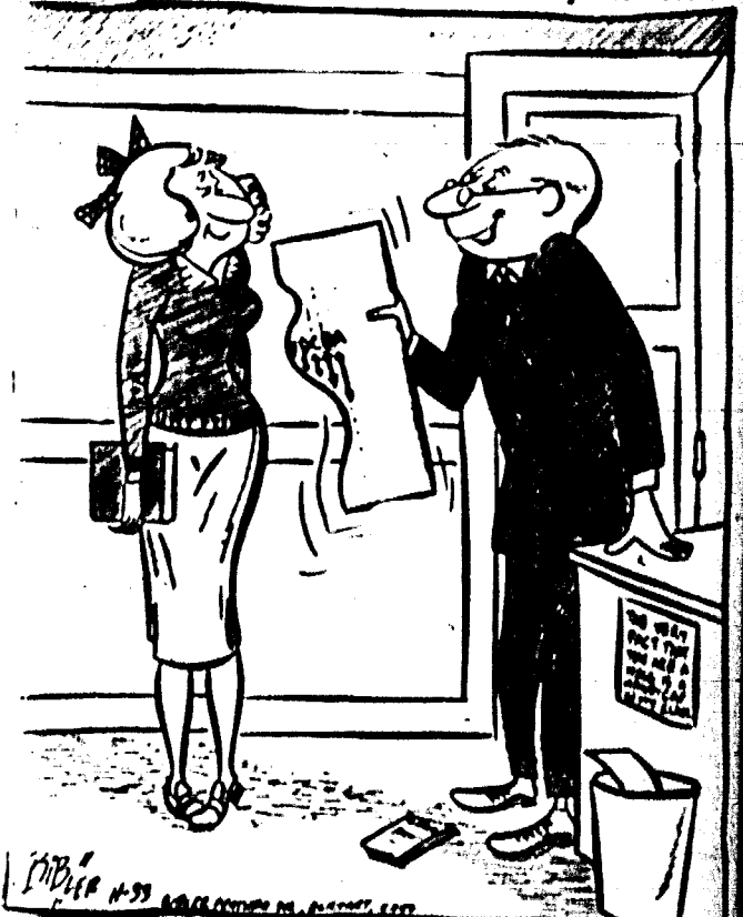
"I wouldn't worry too much about passing, Miss Freeman, as long as I'm grading on the curve."