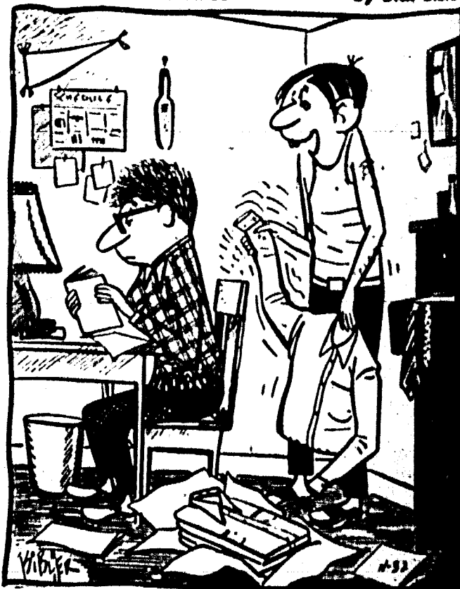
"That dang laundry has fouled up again—I don't take chances!"