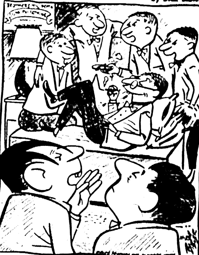
"He's the most sought-after 'Rushes' on campus... It's rumored he can cut hair and may even have a barber license."