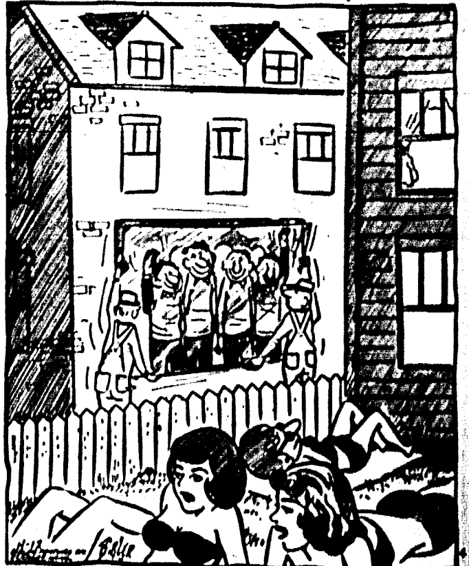
"I would think they'd want a 'picture window' like that in front of the house!"