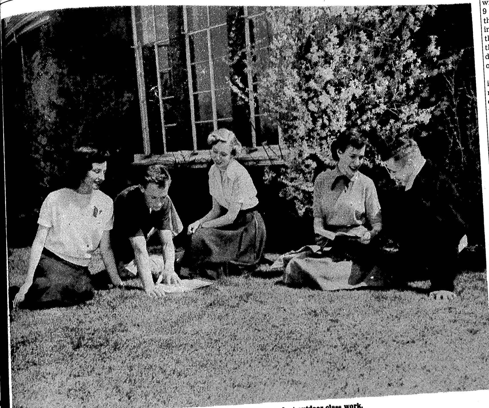
Spring is here, and with it comes sunshine and student outdoor class work.

The Boise Junior college choir will take its annual tour April 8, 9 and 10. On Wednesday, April 8, the group will present a program in Kuna at 9 o'clock a.m. At 11:00 they will travel to Nampa, then they will conclude their Wednesday program in Caldwell at 2 o'clock.