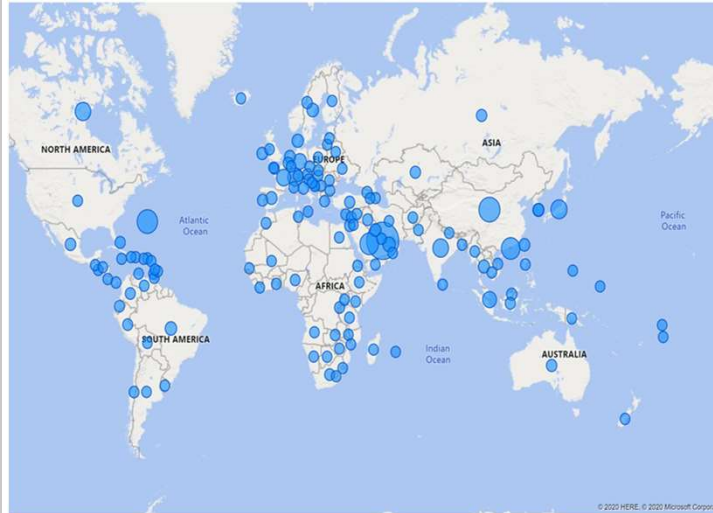
Figure 1: Geographical location of countries that provide funding to US universities