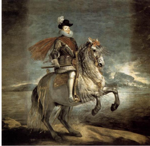
Figure 1: Diego Velázquez, Philip III , 1629-1635, oil on canvas, 118 in. x 83.4 in. Museo Nacional del Prado, Madrid, Spain. < https://www.museodelprado.es/en/the-collection/online-gallery/on-line-gallery/obra/felipe-iii-on-horseback/ >