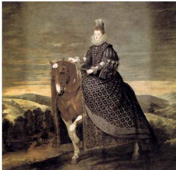
Figure 2: Diego Velázquez and others, Queen Margaret of Austria , ca. 1635, oil on canvas, 116 in. x 83.4 in. Museo Nacional del Prado, Madrid, Spain. < https://www.museodelprado.es/en/the-collection/online-gallery/on-line-gallery/obra/queen-margarita-de-austria-wife-of-felipe-iii/ >