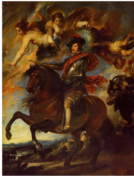
Figure 6: After Peter Paul Rubens, Philip IV of Spain on Horseback , ca. 1628, oil on canvas, 132.6 in. x 103.5 in. Uffizi Gallery, Florence, Italy. < http://www.virtualuffizi.com/philip-iv-of-spain-on-horseback.html >