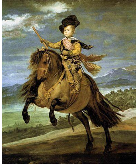
Figure 5: Diego Velázquez and others, Prince Baltasar Carlos on Horseback , ca. 1635, oil on canvas, 83.2 in. x 70 in. Museo Nacional del Prado, Madrid, Spain. < https://www.museodelprado.es/en/the-collection/online-gallery/on-line-gallery/obra/prince-baltasar-carlos-on-horseback/ >