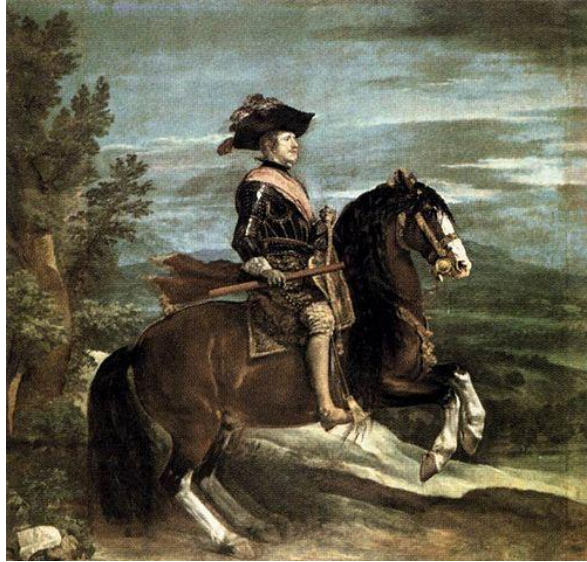
Figure 3: Diego Velázquez, Philip IV on Horseback , 1634-1635, oil on canvas, 119.3 in. x 125 in. Museo Nacional del Prado, Madrid, Spain. < https://www.museodelprado.es/en/the-collection/online-gallery/on-line-gallery/obra/felipe-iv-on-horseback/ >