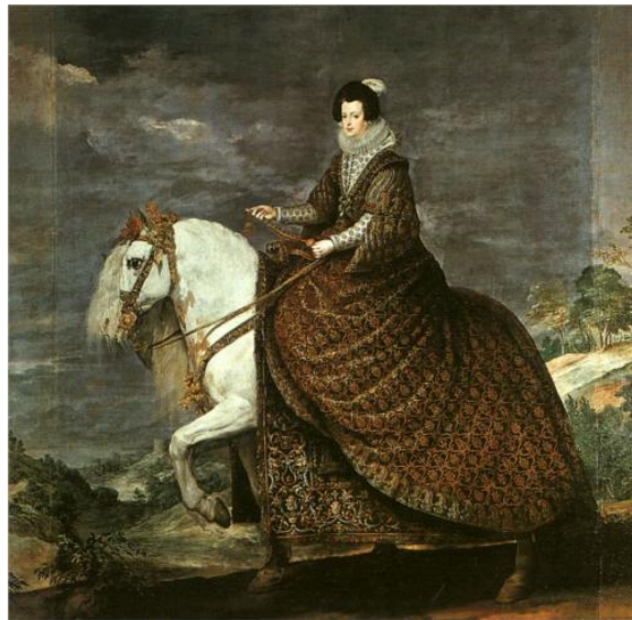
Figure 4: Diego Velázquez and others, Isabella of Bourbon on Horseback , 1634-1635, oil on canvas, 118.5 in. x 124 in. Museo Nacional del Prado, Madrid, Spain. < https://www.museodelprado.es/en/the-collection/online-gallery/on-line-gallery/obra/queen-isabel-de-bourbon-wife-of-felipe-iv-on-horseback/ >