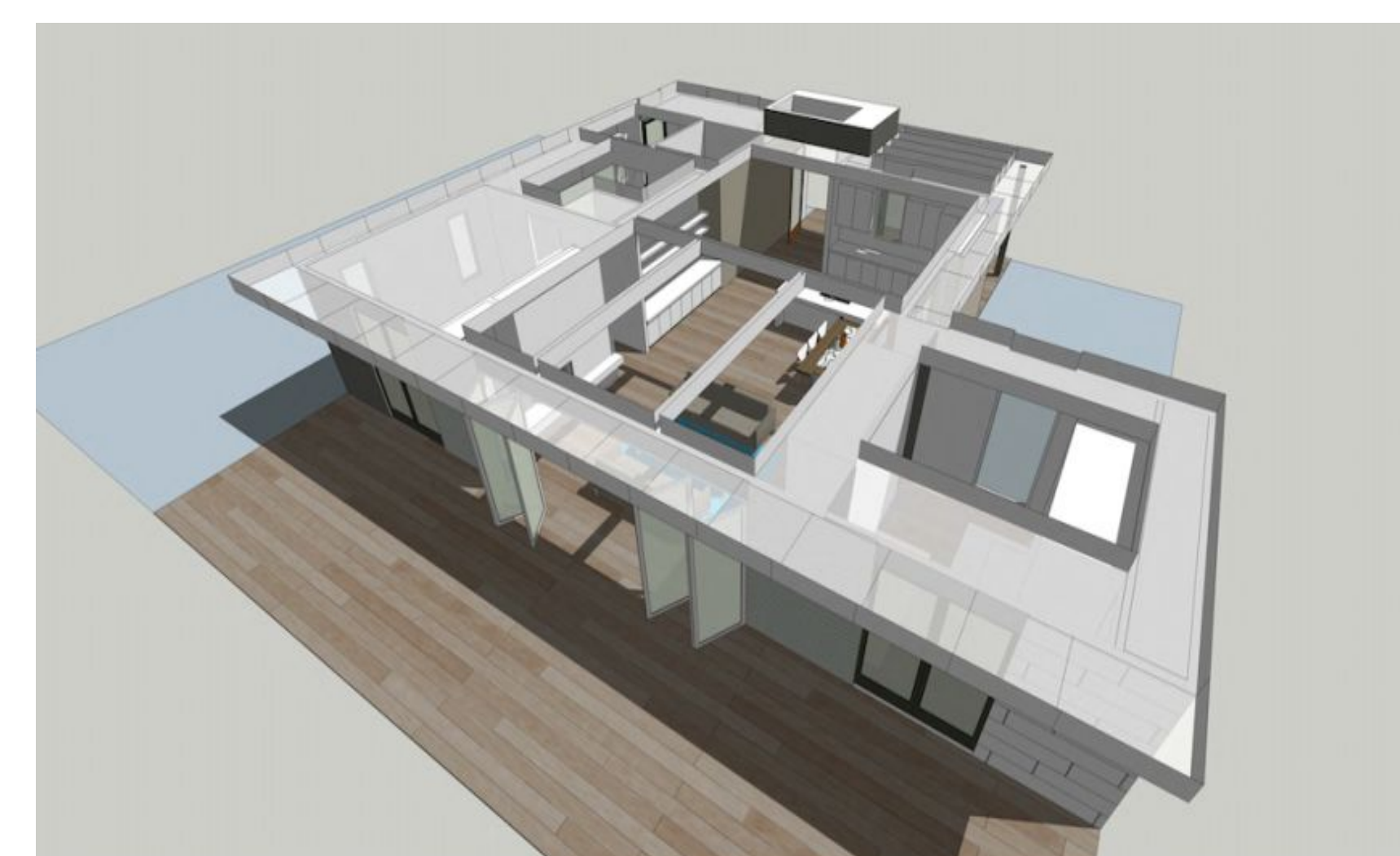
Figure 4. A Modular Site-Built Hybrid