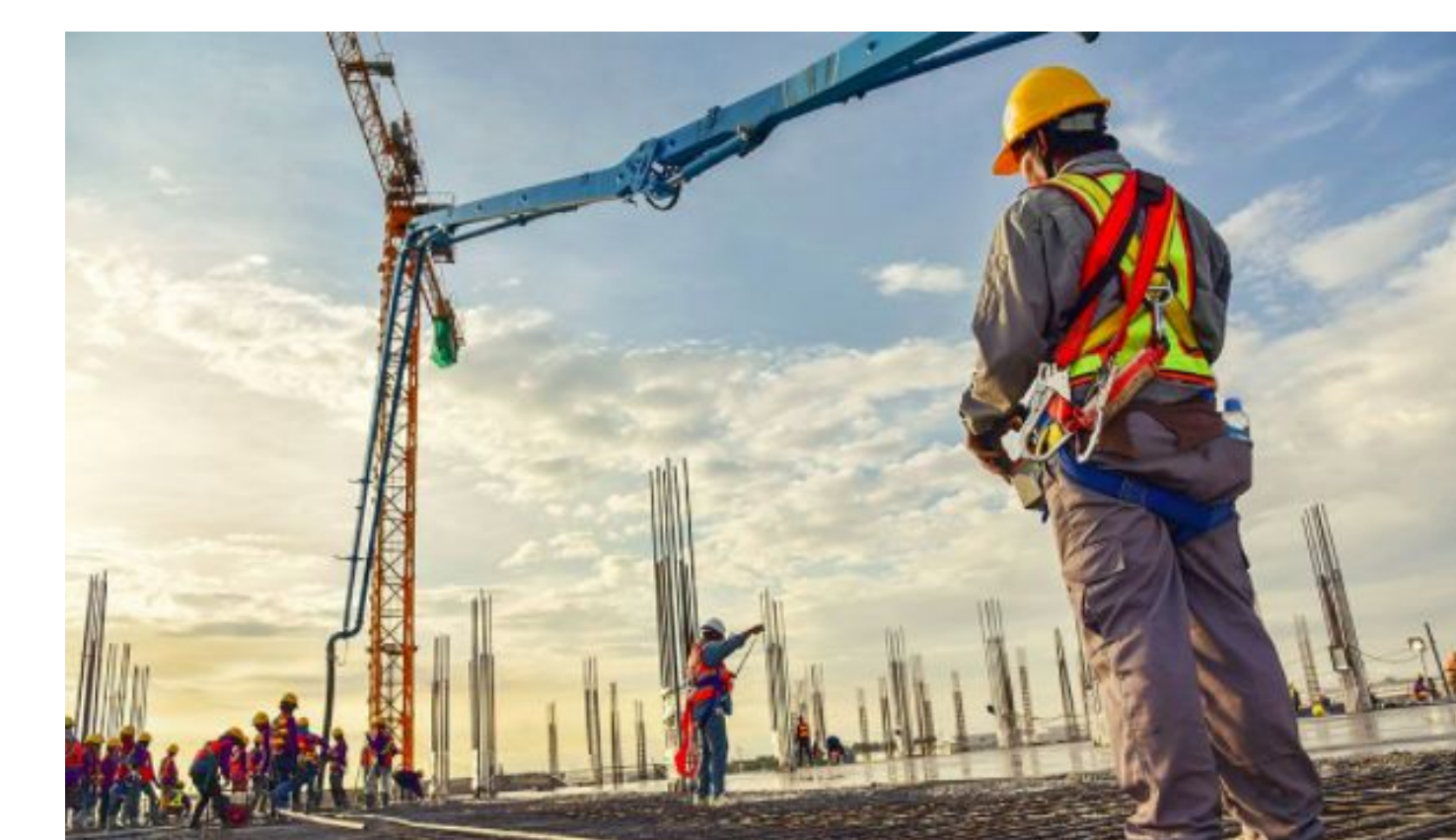
Figure 5. A Construction Worker Overlooks a Job Site