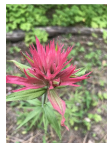
Before and after using Snapseed on my phone in just a few minutes.