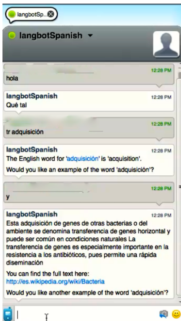
Figure 2. An example of a translation request using Langbot; the username has been blocked to protect anonymity.

instantaneously take the learner to an external site, Spanish Dict.com 10 , where the learner could see a list of synonyms, conjugation charts (if appropriate), and in many cases a video with a native speaker who uses the word in context, thereby providing the pronunciation of the word as well.