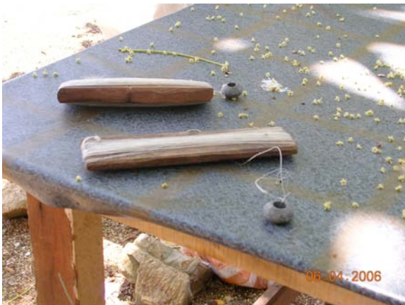
Figure 2.1. The traditional "cuerda" the most rudimentary fishing tool still used in Venado. Taken by Maria Venegas 06-04-06.