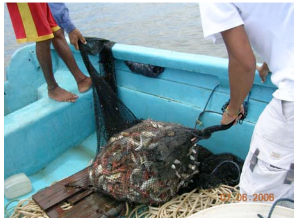
Figure 2.2. Young men fishing with the rastra. Taken by Maria Venegas 07-06-06.