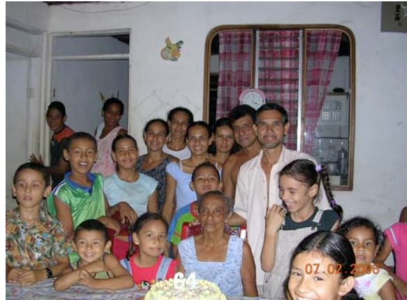
Figure 1.1 The Salas Family celebrating the grandmother's birthday. Taken by Maria Venegas 07-02-06.