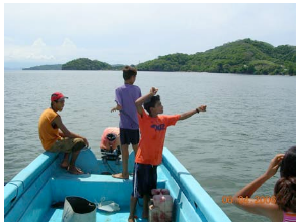
Figure 1.3 Children fishing with the traditional "cuerda."