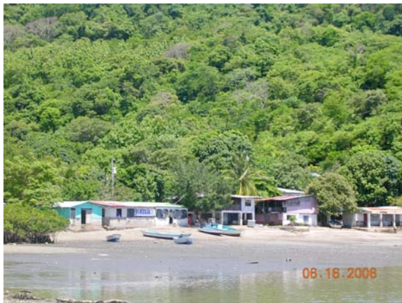
Figure 3.1. Jicaro community, all the houses are within the 200 meters prohibited by the Marine-Terrestrial Law. Taken by Maria Venegas 06-16-06.