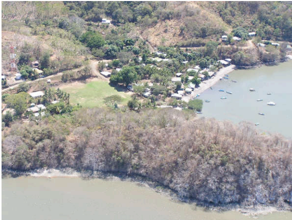
Figure 1a. Aerial photo of Venado Island.