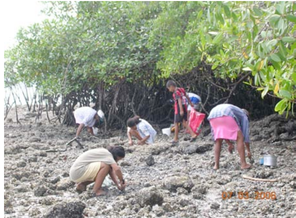
Figure 2.4. Women and children looking for clams in the mangroves. Taken by Maria Venegas 07-03-06.