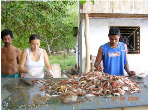
Figure 2.3. Islanders separating the rastra's caught for shrimp and edible fish. Taken by Maria Venegas 07-06-06.