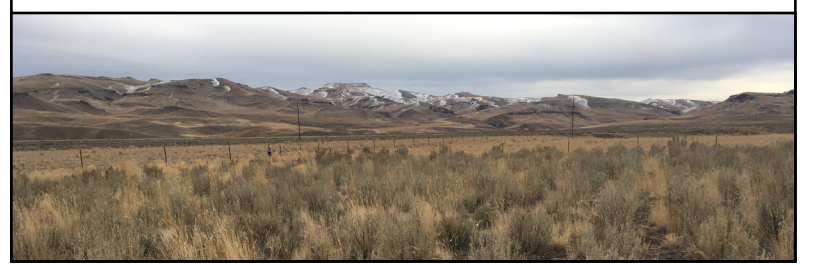
Figure 1. Image of Soda location in fall 2020 provided by Andrii Zaiats.

Biologists require multi-spectral data to monitor changes in 3D scale. Remote sensing technologies allow accurate monitoring and provide extensive data for models used in restoration outlooks.