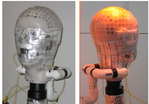
Figure 1. Illustration of thermal manikin system used in evaluating the thermodynamic characteristics of protective headwear.

value and information of the temperature difference between the input air and the output air permitted the calculation of total manikin heat loss. The manikin design included sealed perforations on the skull to enhance heat transfer. Additional insulation padding on the face and neck reduced heat loss to the environment. The design of the thermal manikin is shown in Figure 1.