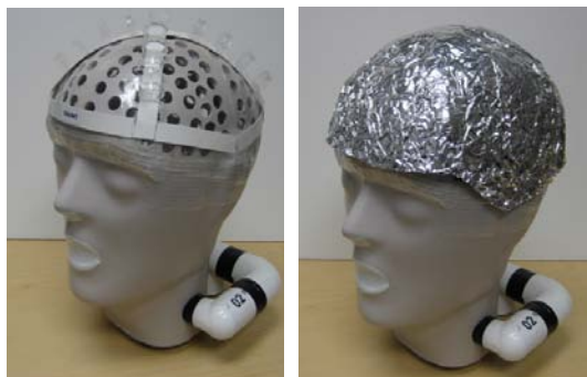
Figure 2. Illustration of thermal manikin wearing the spacer harness and reflective helmet.

manikin configuration. Infrared radiation was generated using three variable intensity 250 Watt infrared heat lamps which were directed onto the manikin head. The thermal characteristics of the model cap and the spacer harness system were evaluated for 200, 400 and 600 watt infrared power input levels. Reid and Wang (2000) showed that the temperature is not uniform on the skin surface. Therefore, three thermocouples were used- left temple, center, and right temple - to obtain the mean surface (“skin”) temperature on the head.