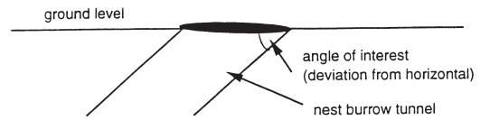
Fig. 1. Illustration depicting tunnel entrance angle and its measurement, i.e., deviation (in degrees) from horizontal.

We measured vegetation within 2 m of the burrow entrance to determine vegetation height near burrows. Burrowing Owls often nest in areas with sparse or low vegetation (MacCracken et al. 1985, Rich 1986, Green and Anthony 1989). We measured distance to nearest road and irrigated agriculture to determine if owls avoided roads because of potential vehicular disturbance (Plumpton and Lutz 1993) or nested nearer irrigated agriculture because of abundant prey, for example (Rich 1986, Lepitch 1994). Finally, because owls frequently use perches near nests (personal observation), and taller perches may afford increased visibility and early detection of predators (e.g., Green and Anthony 1989), we recorded dis-