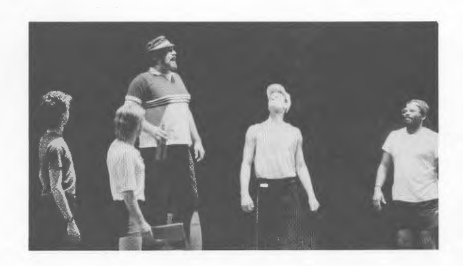
Lodging accommodations and special support for the Idaho Invitational Theatre Arts Festival provided by University Inn.