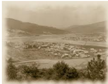
Idaho City, 1887

Tuesday, March 27 th : we'll go to Idaho City (the original capital of Idaho) for a historical tour, a great lunch and a short hike. (There is still snow on the ground, so dress warmly and wear boots!)