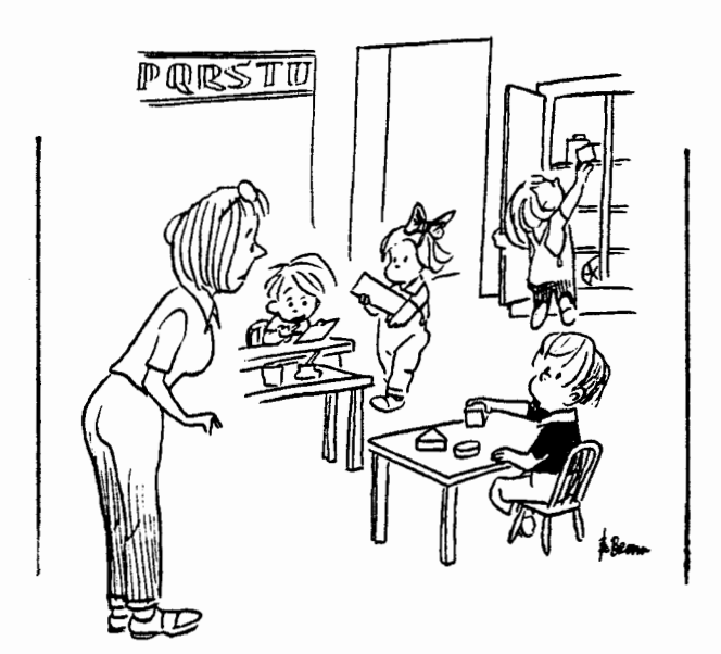
"I learn a lot of stuff here, but it sure cuts into my day!"

Church soothed the ruffled feathers of his constituents, saying, "I certainly understand your concern that religious programs not be harassed or removed from the air, and I'm eager to do whatever I can to make sure that the matter is resolved equitably." Hе avoided direct comment reminding his correspondents that the FCC is not directly under congressional control. "The FCC said. Hе is independent regulatory agency, and as a member of Congress and of the legislative branch of the government I have no voice in its actions or docket case decisions."