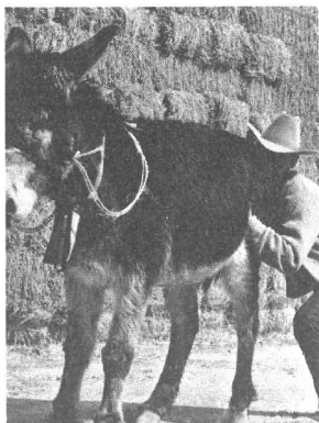
A warning to all Freshmen

Boise College expects students to be ladies and gentlemen. The College attempts to create the environment to further a student's growth and development in all worthwhile areas. Particular emphasis is placed on preparing individuals to make significant contributions to our democratic society. Pursuant to this, students are expected to abide by the rules of the City of Boise, the State of Idaho, and the United States. In addition, your attention is drawn to Boise College policy regarding the use of alcoholic beverages—the possession, use, or serving of which is not permitted on the Campus or at any College sponsored function. Students who violate this regulation are subject to disciplinary action.