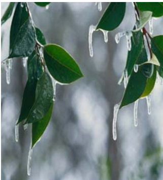
Unknown photographer, Icicles