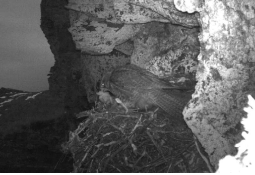
FIG. 2. Photo taken 1 June 2014 at 04:10 AKDT by a Reconyx PC 800 motion-activated camera. The photo shows a Gyr falcon ( Falco rusticolus ) nestling held in the adult's beak. This illustrates the moment the adult moved the nestling to a new location following partial nest collapse. The location of the new nest site is outside the view of the camera.