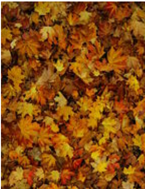
Unknown photographer, Autumn Leaves