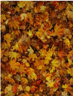
Autumn Leaves